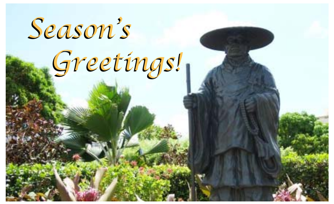
Brought from Japan to Hawaii, a statue of Shinran Shonin arrived at Shinshu Kyokai, one of the delightful centennial changes. What wonders might church members behold in the next hundred years?

'Hands together in reverence & gratitude'