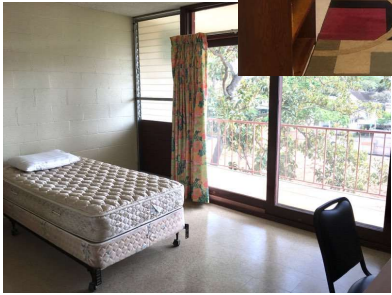
Partially furnished lanai room