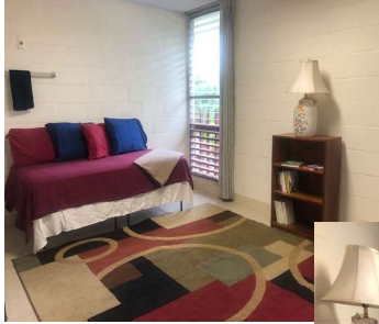
Room staged for photos.

All rooms are single occupancy with basic furnishings.