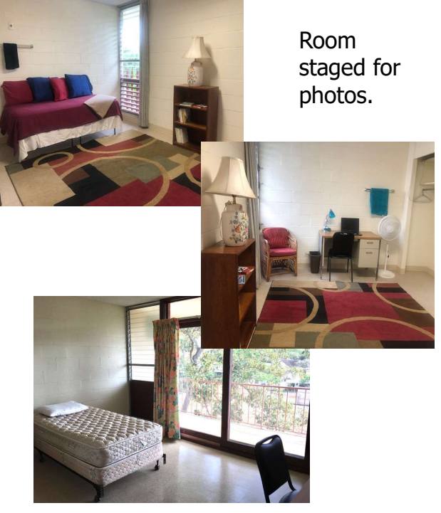
Partially furnished lanai room

All rooms are single occupancy with basic furnishings.