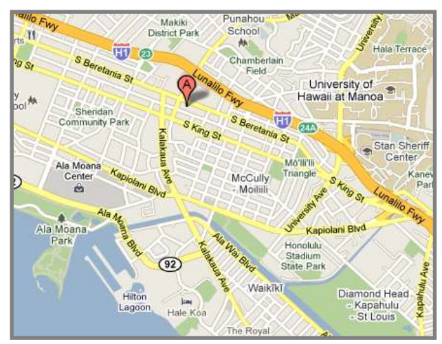
The dormitory is conveniently located near various bus routes, and is within walking distance to the University of Hawaii at Manoa.